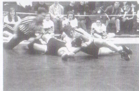
1994 WIAA 5th Place Finisher 160 Lbs. 37-3